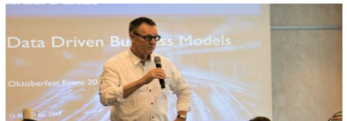
Figure: Data driven business models - value add, (example industrial goods)

The digital landscape is evolving significantly. The internet of everything and everyone is leading to an exponential rise in the amount of data. By 2021 it is expected that over 30 billion devices will be connected, which includes person-to-person (P2P), machine-to-person (M2P) and machine-to-machine (M2M) communication.